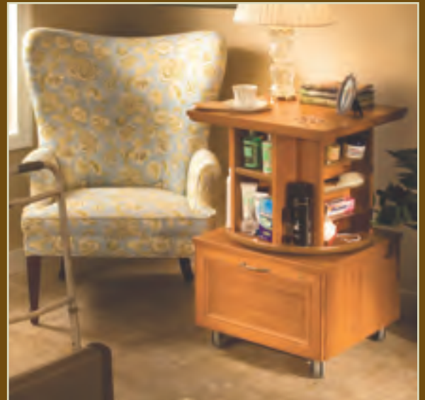
My Companion™ Chairside