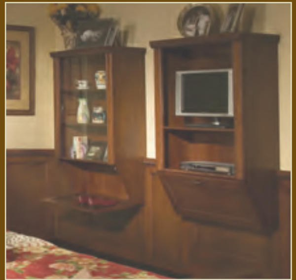
Wall mount furniture

When your next project warrants top-quality, custom-designed case goods, consider Artone. You'll find we deliver the finest combination of progressive style and turnkey service in the industry. All at a price that's undeniably beautiful.